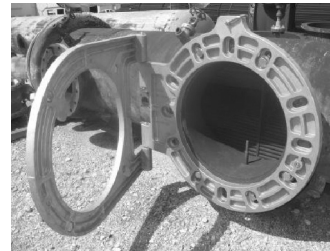
Swing Out Assembly Adaptor