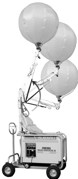
NLS120A (1200W, Arc Light)